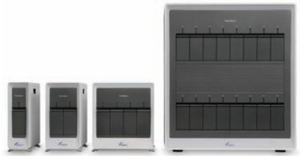
Figure 2. GeneXpert instruments with 1, 2, 4 and 16 modules

The range of GeneXpert instruments includes systems with 1, 2, 4, 16, 48 or 80 modules. Modules function independently so that batching is not required and individual tests can be started at different times. Results become available for each test in less than 2 hours, so a GeneXpert instrument with four modules (that is, the GeneXpert IV instrument) has the capacity to perform up to 16 tests in an 8-hour working day . Experience from sites using the platform has shown that during the initial 6-12 months of use, while laboratory staff and clinicians grow accustomed to the test, throughput may be only up to 8 tests a day; therefore, cartridge orders