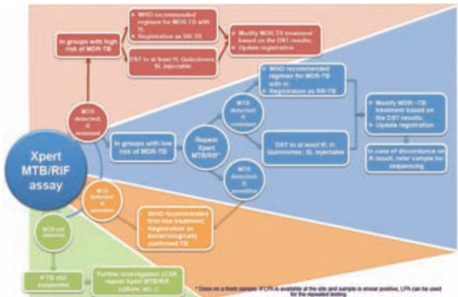
Figure 1. Interpreting results from Xpert MTB/RIF tests

CXR [chest X-ray], DST [drug-susceptibility testing], H [isoniazid], LPA [line probe assay], MDR-TB [multidrug-resistant TB], MTB [ Mycobacterium tuberculosis ], R [rifampicin], RR-TB [rifampicin-resistant TB]